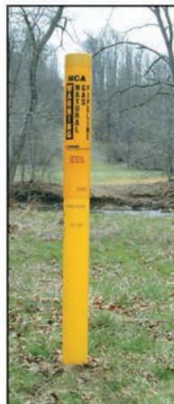
3. High-consequence area entrance or exit marker (arrow on top)