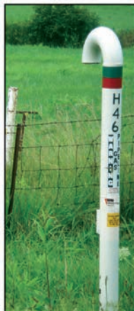
1. Vent Pipe