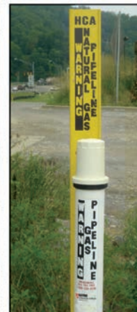
5. HCA marker and cathodic protection test station