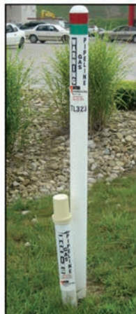
2. Linemarker and cathodic protection test station