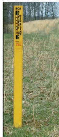
4. HCA line-of-sight marker