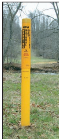
3. High-consequence area entrance or exit marker (arrow on top)