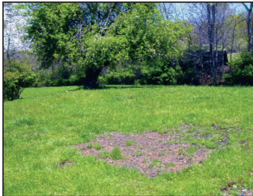
Discolored or dead vegetation can indicate a pipeline leak.

Your call will go directly to the EGTS Gas Control Center, a facility manned 24 hours a day, every day of the year. A Eastern Gas Transmission & Storage team will be dispatched immediately to investigate any reported leaks.