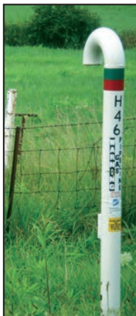
1. Vent Pipe