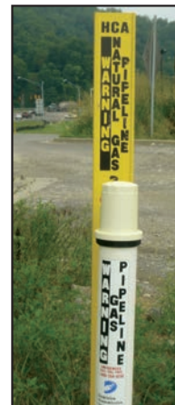
5. HCA marker and cathodic protection test station