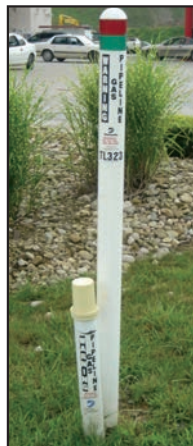
2. Linemarker and cathodic protection test station