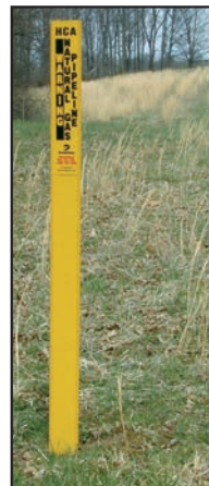
4. HCA line-of-sight marker