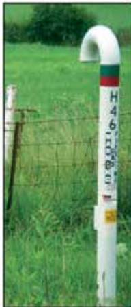
1. Vent Pipe