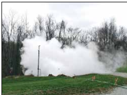
A propane vapor cloud can indicate a pipeline leak.

Propane vapor is normally 1 1/2 times heavier than air as it vaporizes from a liquid state. Therefore, when leaking, it tends to spread along the ground. The cold propane vapors condense water vapor from the air and create a visible fog, which gives an indication of the area covered by the leaking gas: however, ignitable mixtures extend beyond the area of visible fog. (Not all leaks are indicated by vapor. Smaller leaks can be identified by discolored or dead vegetation.)