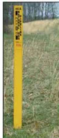
4. HCA line-of-sight marker