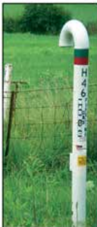
1. Vent Pipe