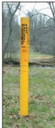
3. High-consequence area entrance or exit marker (arrow on top)