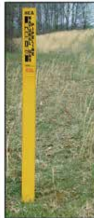
4. HCA line-of-sight marker