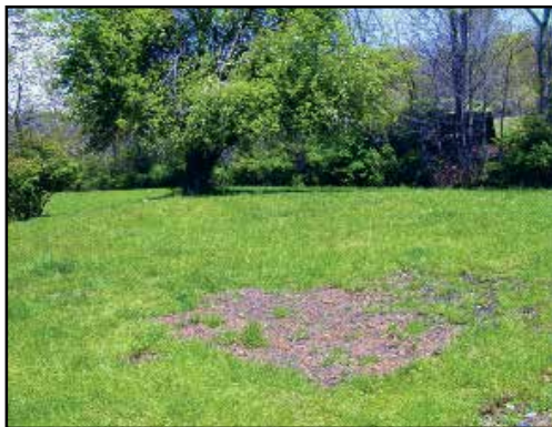
Discolored or dead vegetation can indicate a pipeline leak.

Your call will go directly to the EGTS Gas Control Center, a facility manned 24 hours a day, every day of the year. A Eastern Gas Transmission & Storage team will be dispatched immediately to investigate any reported leaks.