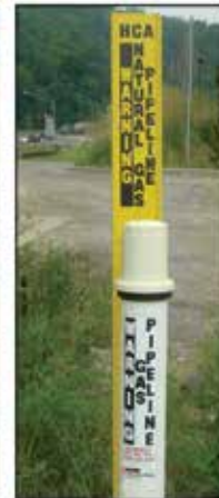
5. HCA marker and cathodic protection test station