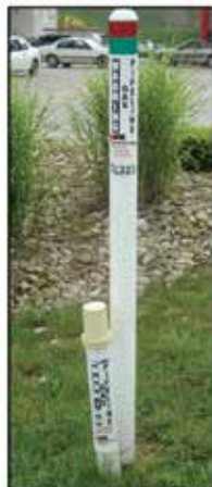
2. Linemarker and cathodic protection test station